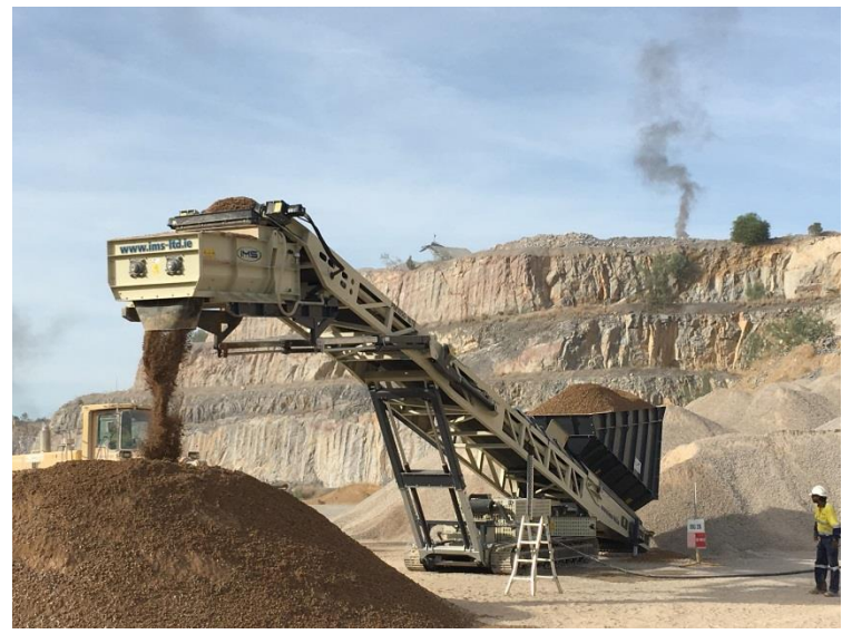
The IMS Pugmill in operation.