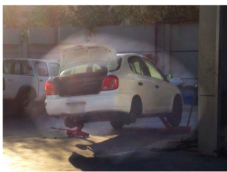
Only 2 jacks and 3 tyres to be changed, no worries. - Sent in from one of our readers in Saudi Arabia

If you have a funny sign or a sticker or a photo involving safety (or if it is just funny) that is just not quite right, please send to: Alan.Robertson@ausrocks.com.au