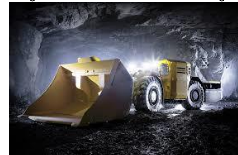
Scooptram ST7 Battery - Photo by Atlas Copco