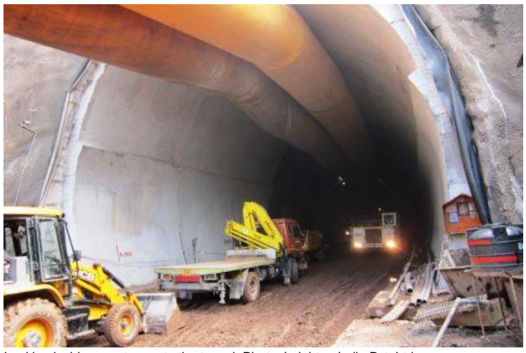
Looking inside an entrance to the tunnel.

Once completed, the tunnel will act as an all-weather alternative to the existing highway that travels 41km through mountainous terrain.