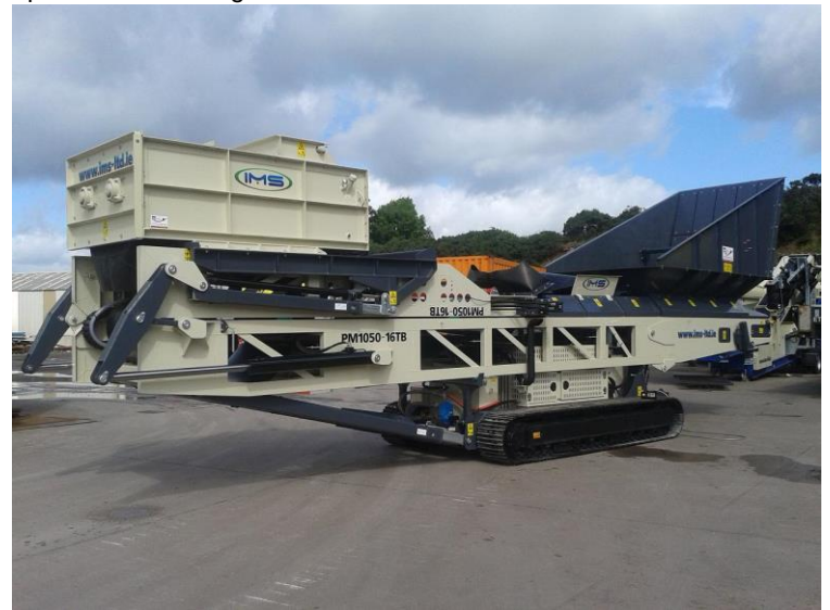
The IMS Pugmill folded up ready to move to site or to be packed away at the end of the day.

The stop/start remote operates the feed hopper, pughead and water pump all from the loader driver to ensure quality control and minimum operator overseeing.